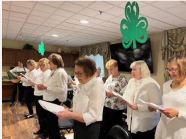
Singing at Brandywine Assisted Living