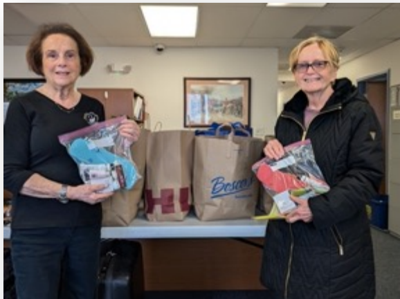
75 First Night Bags delivered to People's Place

Winter Food Drive We are happy to report that 4,014 pounds of food and personal care items were collected. We beat last year's collection by 100 pounds. Thank you everyone!