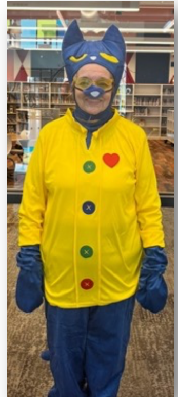
"Pete the Cat" at Read Across America

I am Looking forward to seeing everyone at our March 18 th meeting at the Lewes Library. If you are not attending, please, please send in your proxy for the vote on the by-law amendments. As you may know, we did not have enough voters at the February meeting to hold a vote.