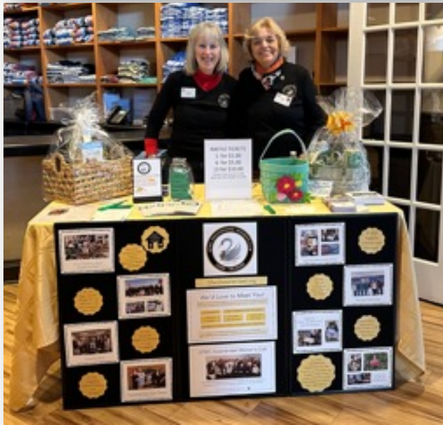
Dine to Donate at Bethany Blues